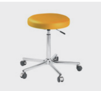
Physician's chair — height-adjustable, manual locking