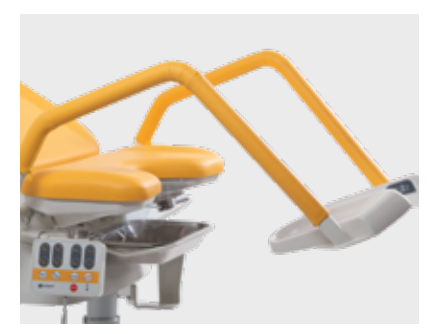
Leg supports with upholstery