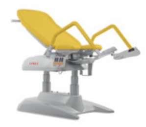
M – Corn yellow