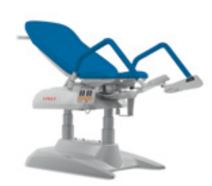
B – Brilliant blue