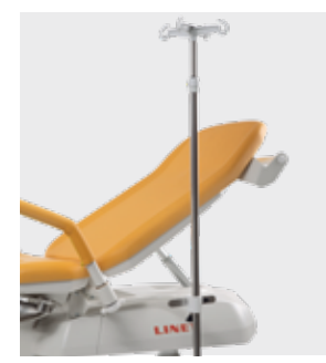
Infusion stand holder