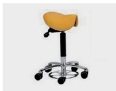
Physician's chair —ergonomic, adjustable feet