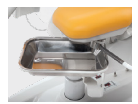
Stainless steel bowl