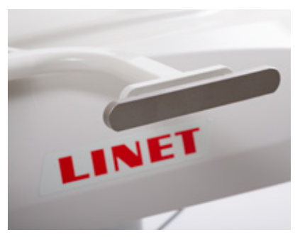
EU bar holder