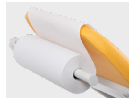
Papper roll holder (standard)