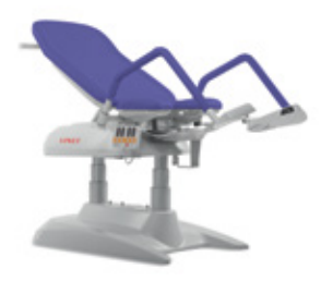
A – Violet