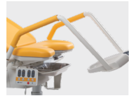
Leg supports with partial upholstery