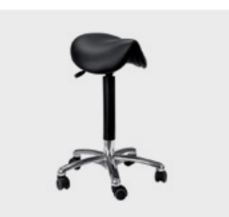
Physician's chair — ergonomic, height-adjustable, manual locking