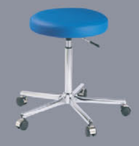
ZK-05.X Doctor's mobile chair