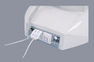
GKB-044 Socket terminal (DE)

GKB-080 Colposcope holder Leica (L) GKB-081 Colposcope holder Leica (R) GKB-082 Colposcope holder Leisegang (L) GKB-083 Colposcope holder Leisegang (R) GKB-084 Colposcope holder Zeiss (L) GKB-085 Colposcope holder Zeiss (R) GKB-086 Colposcope holder Olympus (L) GKB-087 Colposcope holder Olympus (R)