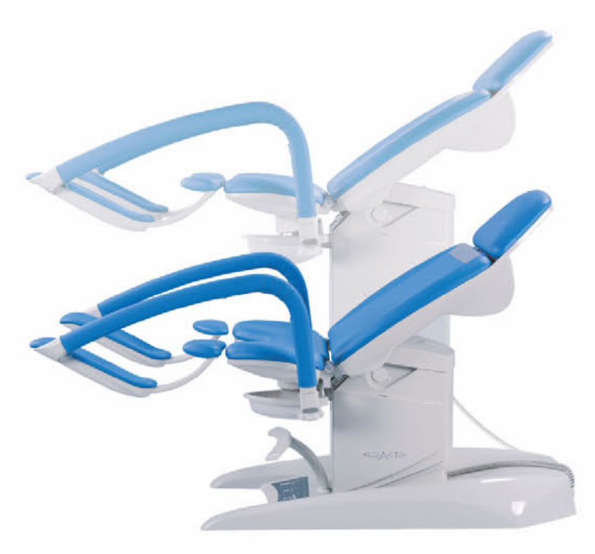
The fastest adjustment of all positions on the market.